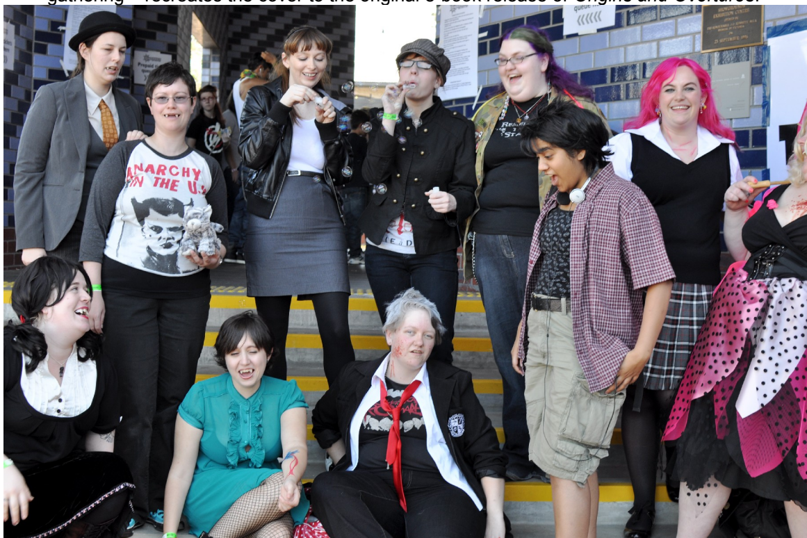
Wolf House fans in-costume at Melbourne Supanova 2010..